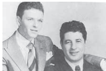
Frank Sinatra and Al Silvani

$: 10,000 - 15,000 • €: 7,500 - 11,000 • SFr: 11,000 - 17,000