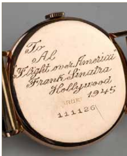
(detail of the engraved case back)

Al Silvani, born March 26, 1910, was an American boxing trainer and actor. He was a close personal friend of Frank Sinatra and spent time out with Sinatra's 'Rat Pack.' He appeared in a number of Sinatra's movies, including "Ocean's Eleven," "From Here to Eternity" and "Assault on a Queen." As one of the most sought-after trainers in the business, Silvani trained over twenty world champions, including Jake LaMotta and Rocky Graziano. He played himself in the 1976 motion picture 'Rocky' and served as a technical advisor in 'Rocky II' and 'Raging Bull.' In 1980, he was inducted into the World Boxing Hall of Fame.