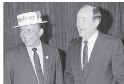
Frank Sinatra & Hubert Humphrey

U.S. Senator from Minnesota and 38th Vice President was the Democratic nominee for President in 1968 (following the withdrawal of President Lyndon B. Johnson and the assassination of Robert F. Kennedy). Though Sinatra was instrumental in helping JFK gain the White House in 1960, he could not quite repeat the feat eight years later for Humphrey, who lost by a narrow margin to Richard Nixon.